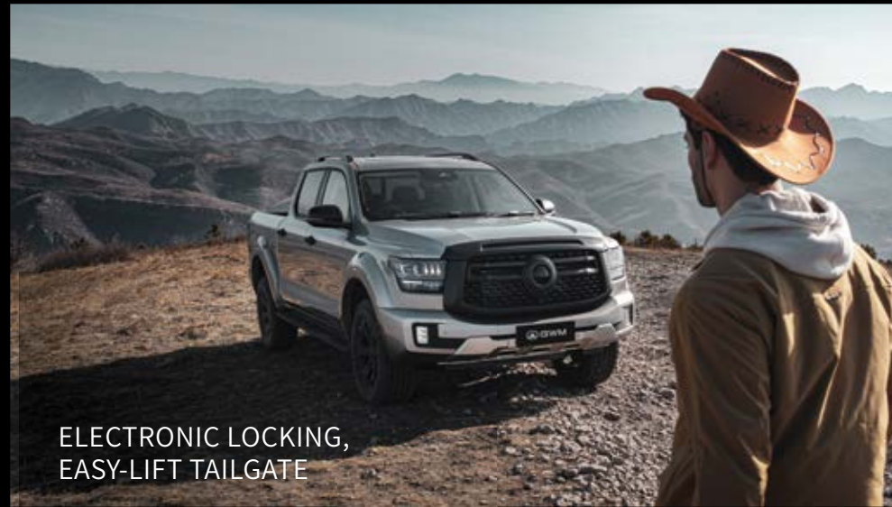
ELECTRONIC LOCKING, EASY-LIFT TAILGATE