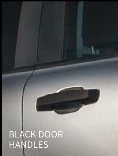
BLACK DOOR HANDLES