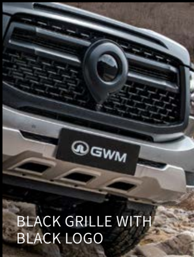
BLACK GRILLE WITH BLACK LOGO