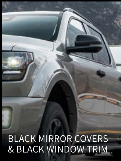
BLACK MIRROR COVERS & BLACK WINDOW TRIM